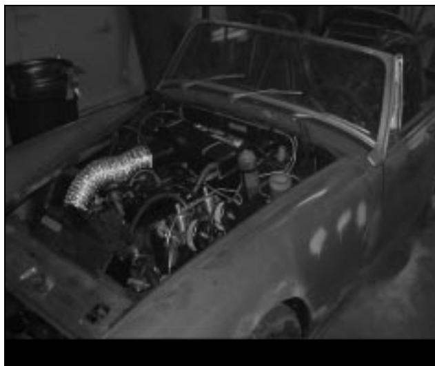
Preston Sowder's Midget Rebuild