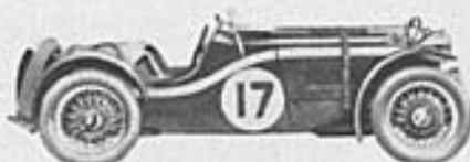
MG "K.3" Magnette

There could be no worthier successor to the MG heritage than the MGA . . . truly the smartest, safest, fastest MG of a long line of champions.