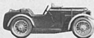
MG "M type" Midget