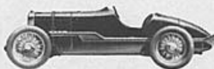
MG "Q type" Racing Midget