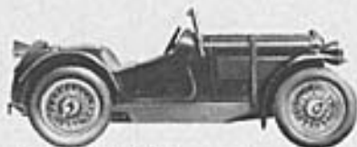
MG "J.4" Supercharged Racing Midget