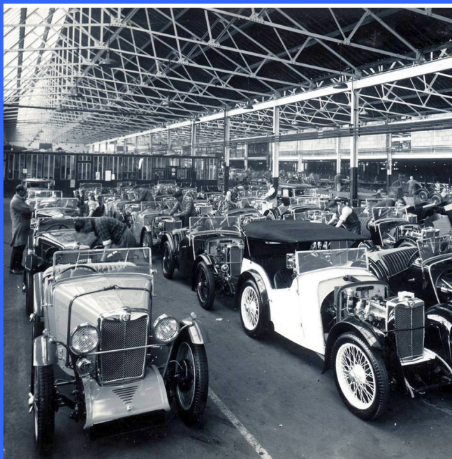
Production At Abingdon Opens In 1930