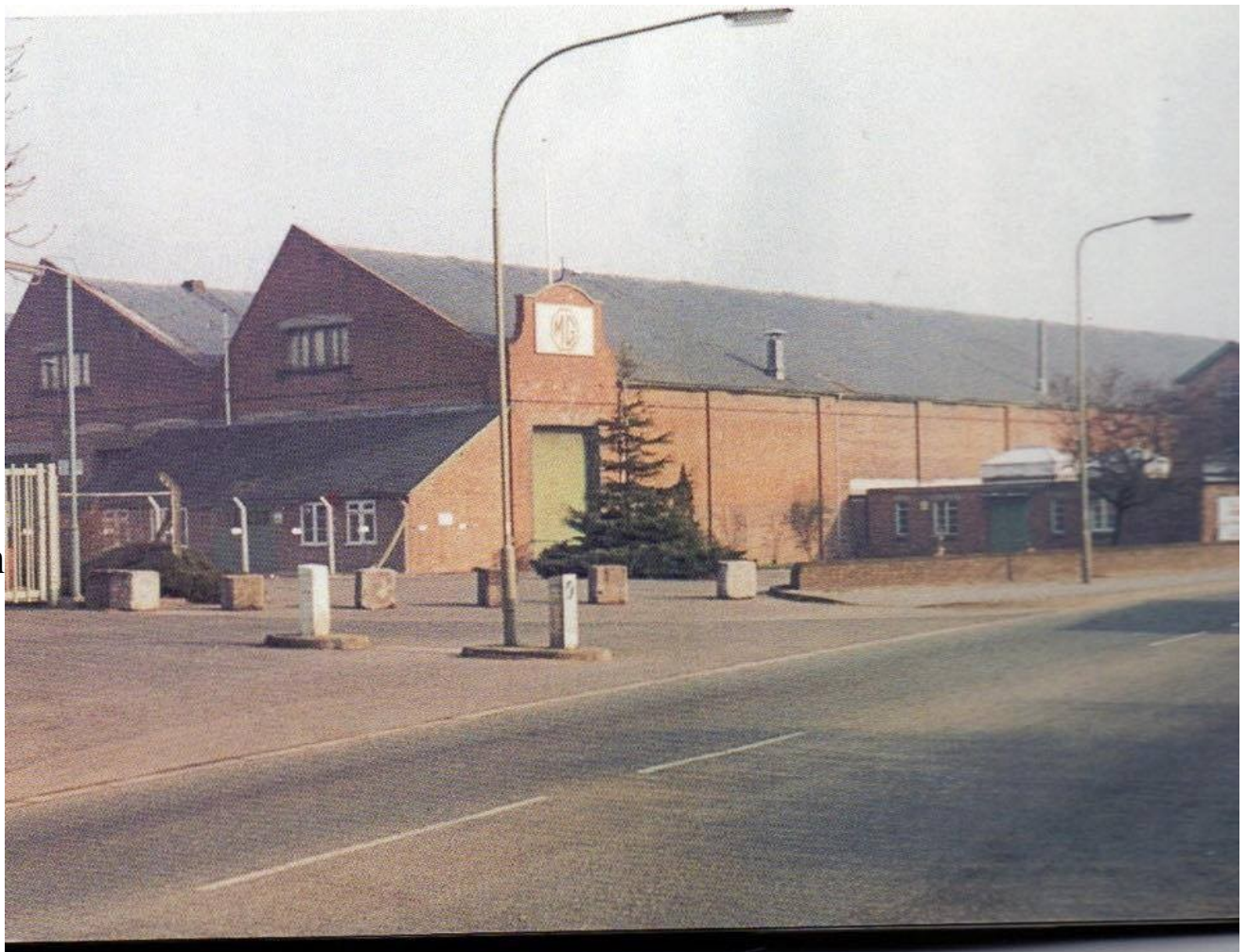
MG Factory Entrance at Marcham Road