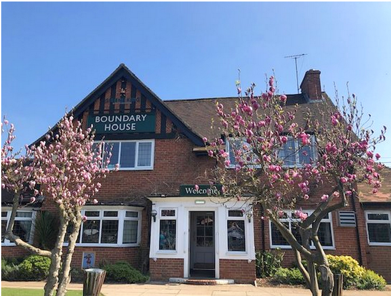
Boundary House Pub