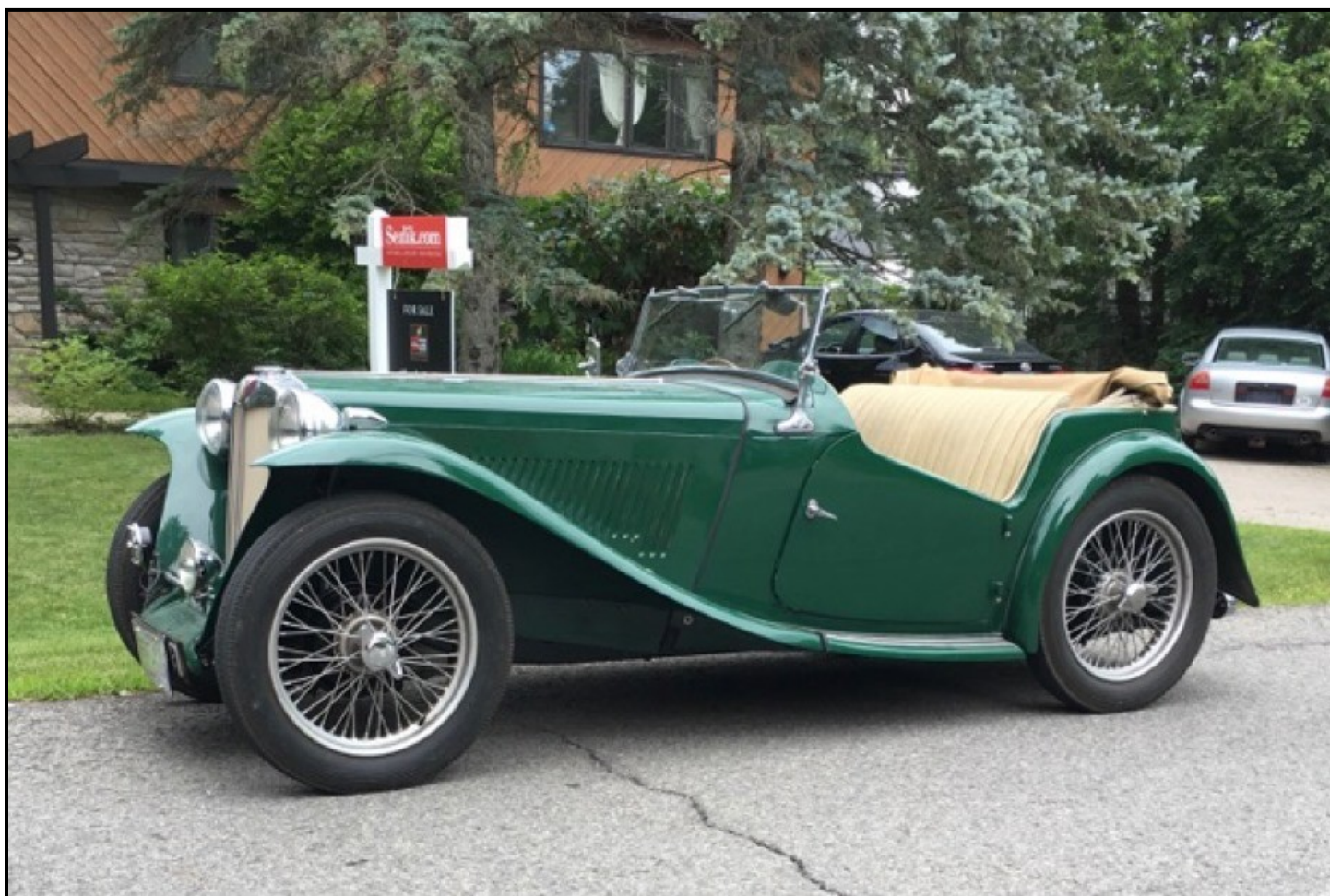
Classic MG TD