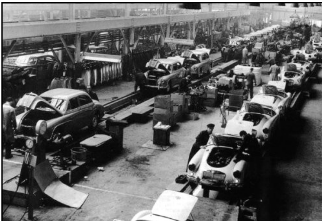
MG Factory at Abingdon; ZA Magnette and MGA lines circa 1955