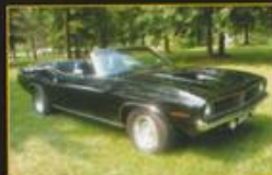
1970 Plymouth Cuda Protected by Corrosion Free, No Rust Ever!