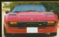
1983 Ferrari GTS Quattrovalve Protected by Corrosion Free, No Rust Ever!