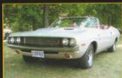
1970 Dodge Challenger RT Protected by Corrosion Free, No Rust Ever!

Collector cars are appreciating investments. Keeping them looking good increases their value.