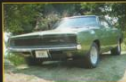
1968 Dodge Charger RT Protected by Corrosion Free, No Rust Ever!